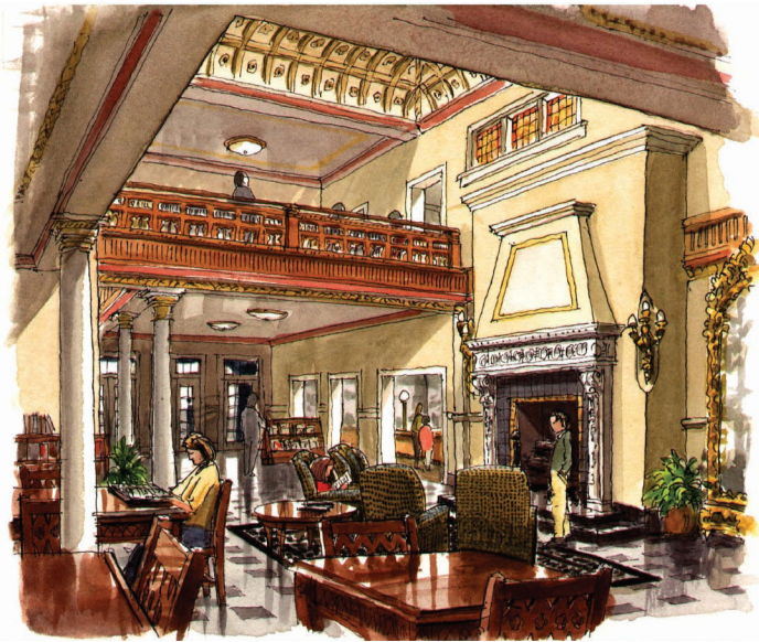
First Floor Lobby - Artist's Rendering

The Fort Piqua Hotel renovation project has been underway since late 2007. Currently, there have been approximately 50 workers in the building each day, loads of materials and equipment moving in and out and around the site, and obvious progress has been made. What the casual observer might not know is that the project changed course drastically at the end of the year.