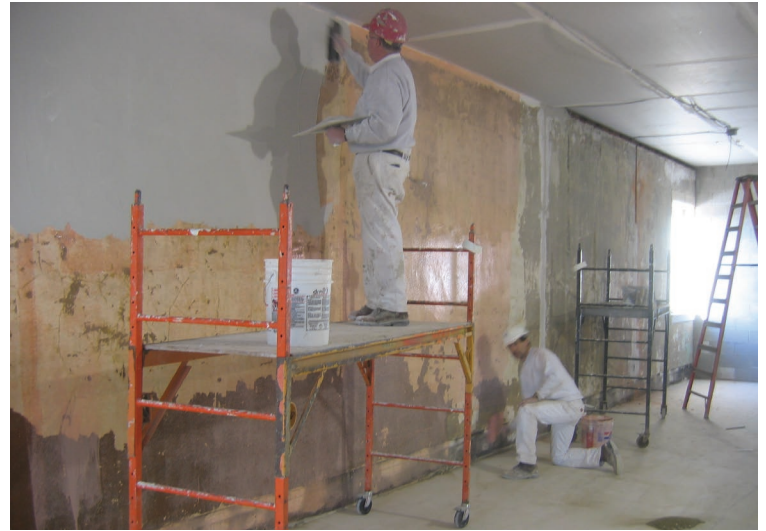
Plaster Being Placed on Lobby Walls

For the first 11 months the project was an interior demolition,